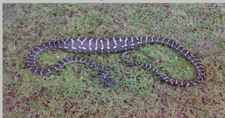
A carpet python removed from a guinea pig cage.

Leave the snake exactly where you found it and WAIT! We will be there as soon as possible. DO NOT attempt to capture or contain any snake as 90% of all snakebites are caused by people interfering with a snake.