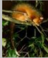
Below left - right: - Common Ringtail, Common Brushtail, Short Eared Possum.